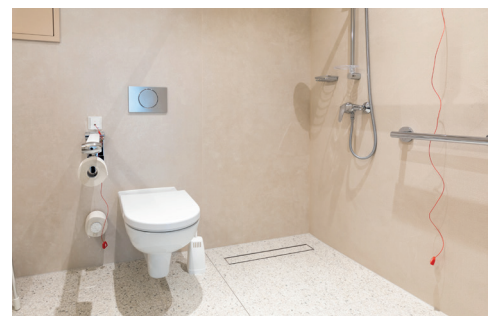
Bathroom in room No. 155