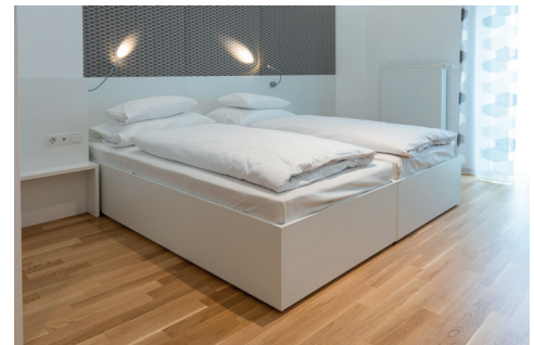
Room No. 155