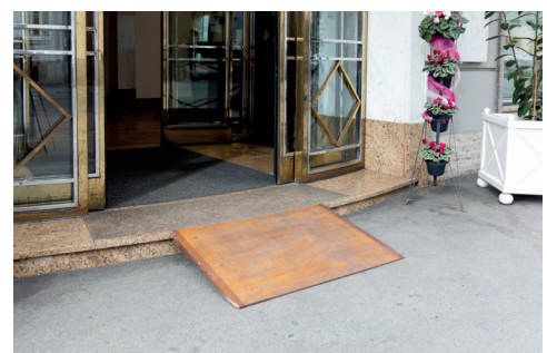
Entrance with mobile ramp