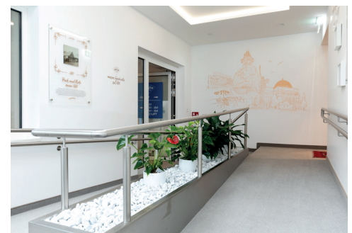
Ramp to room No. 155