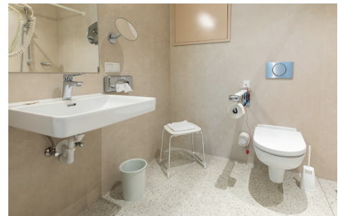
Bathroom in room No. 155